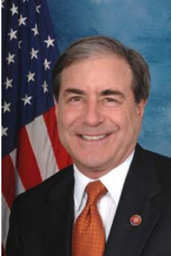
Congressman John Yarmuth (KY-3)

Breaking News! KY Congressman Yarmuth, Chandler and U.S. House Vote to Repeal Military's "Don't Ask, Don't Tell"