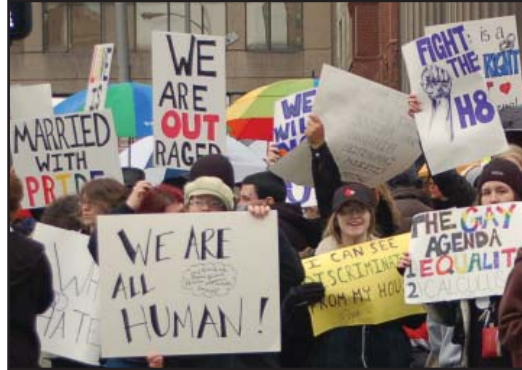
Nearly 300 Louisvillians joined in nationwide protest of California's Proposition 8 in November.

As for the 18,000 same-sex couples who got married between May 15 th and Election Day, their status is uncertain. The wording of the amendment that was placed into the California Constitution states, "Only marriage between a man and a woman is valid or recognized in California." Opponents of LGBT rights will argue that even those marriages already celebrated can no longer be "recognized" once the amendment is passed. However, the fact that these couples (and many others, including children, people who sold property on the belief that these couples were married, etc.) married in good faith and in reliance on a then-valid state Supreme Court decision will most likely lead the California courts to hold their marriages valid and entitled to continuing legal recognition, regardless of the ultimate fate of same-sex marriage generally.