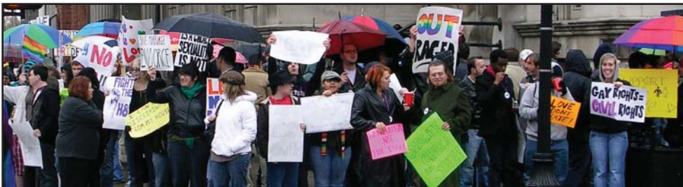
Louisville's Join the Impact Protest of Prop 8 drew a large crowd that encircled City Hall.

If the Prop 8 challenge fails in court, then the next step will be to seek a repeal at the next opportunity, which is likely to be the 2010 elections. After the successful and highly publicized nationwide protests that followed the vote, there is great momentum in California to start the petition drive necessary to put the issue back on the ballot. The key issues will be whether the players who were behind the unsuccessful "No on 8" campaign have learned the lessons from that campaign, including how counter-productive it is to "hide" actual LGBT people from the ads and messages being delivered (as if the rights being talked about exist in a vacuum), and how you cannot win in a state as big and diverse in California without engaging the issue from the grassroots up, and with a broad coalition driving the fight. Finally, it will also be critical to strip our opponents of what proved to be an effective, albeit deceptive, argument in their campaign – that equal recognition by the state of our relationships as marriages would mean that any church would be required to perform ceremonies that are contrary to the beliefs of that faith. Once that false claim is put to rest, and a better campaign is waged that puts into practice the hard lessons of the last race, there is every reason to believe that California in 2010 can and will be the site of an important, historic victory in the fight for marriage equality.