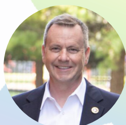
BUDDY WHEATLEY KY SECRETARY OF STATE UNCONTESTED