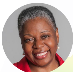
PAM STEVENSON KY ATTORNEY GENERAL UNCONTESTED