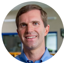
ANDY BESHEAR KY GOVERNOR DEMOCRATIC PRIMARY